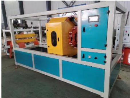
6.切割锯STG-315型 1台 cutting saw