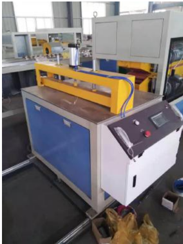
5. 切割机 cutting machine