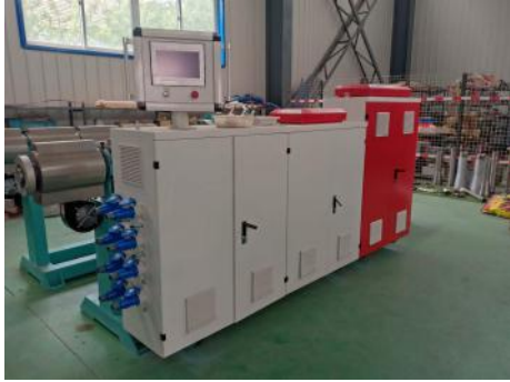
1.单螺杆挤出机SJ-80×156 1台 single screw extruder SJ-80×156 1set