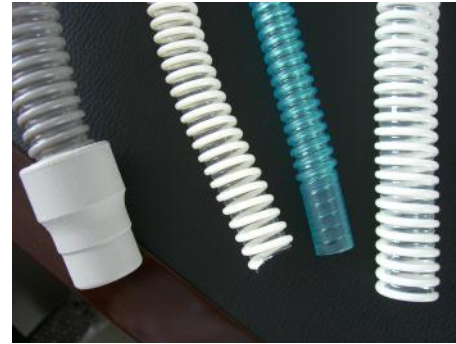
7.根据模具可以生产各种波纹管 according to change the mould it can produce many kinds of corrugated pipe