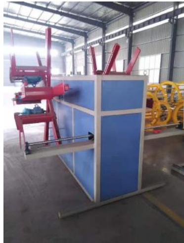
6. 打卷机 winding machine