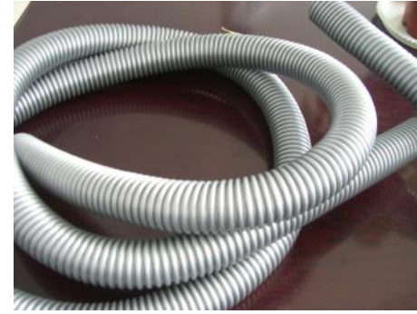
3.Left and right color distributor

Thank you for your reading, looking forward to your visit.