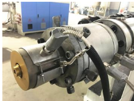
3.双螺杆挤出机头 mould head