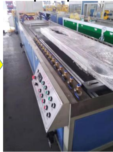
3. 真空定径平台 vaccum sizing platform