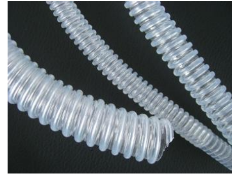
8.根据模具可以生产各种波纹管 according to change the mould it can produce many kinds of corrugated pipe