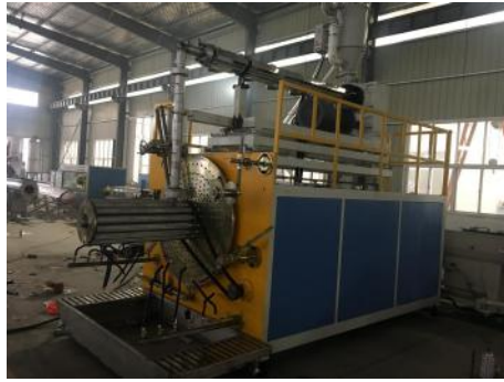
6.缠绕成型机 wind forming machine