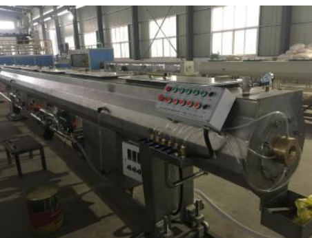
5.真空定径冷却系统 vaccum sizing cooling system