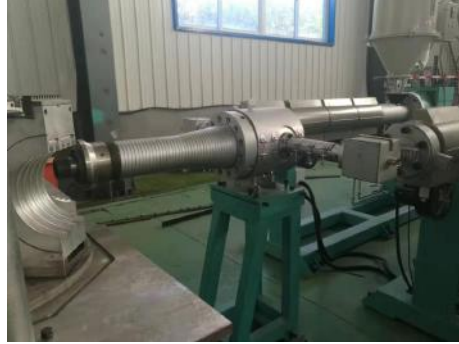
2.螺杆机头 mould head