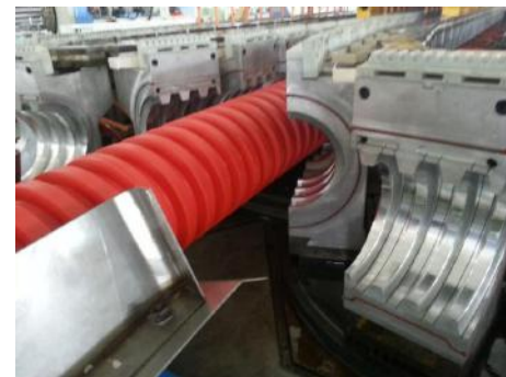
4.波纹管成型 corrugated pipe forming