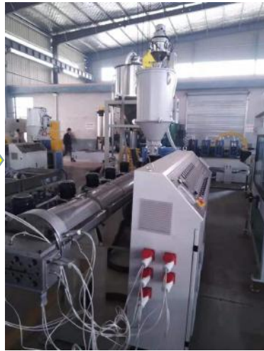
2. 单螺杆挤出 single screw extrusion