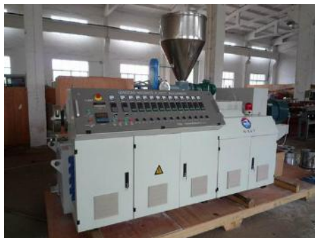
2. 双螺杆挤出 twinscrewextrusion