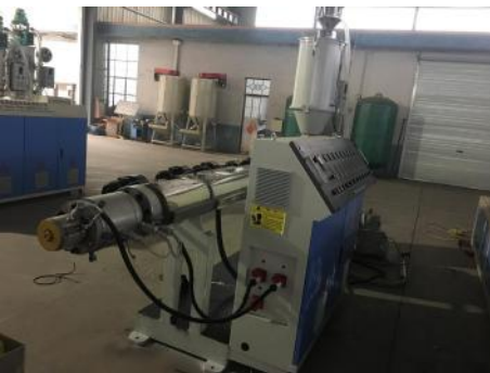
1.单螺杆挤出 singel screw extrusion