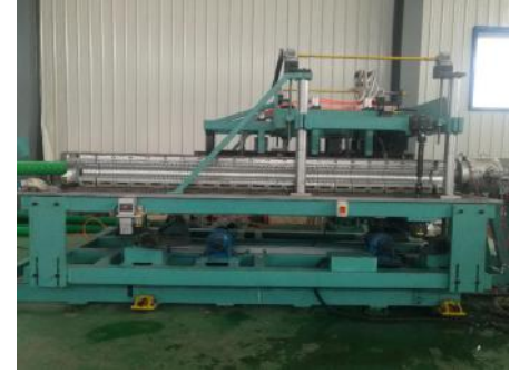
4.成型机SBCJ-315型（带有自动润滑系统） 1台 forming machine (with auto lubrication system) 1pc