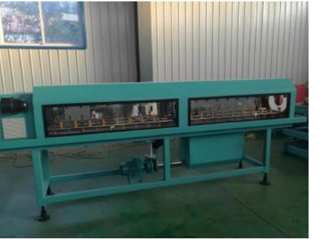
5.喷淋水槽 spray water channel