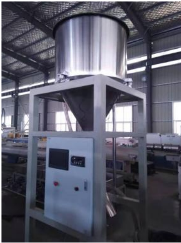
1. 上料漏斗 feed hopper