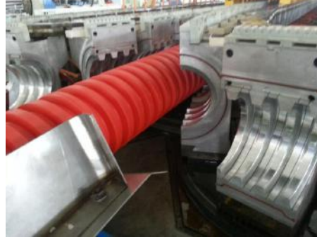
3.模具调整支架 +连接体件 1台 mould adjustable bracket & connected part