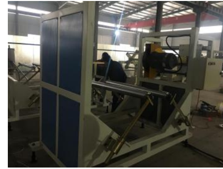
6. Melt pump