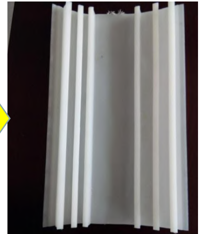
8. 根据模具可以生产各种止水带 according to change the mould it can produce many kinds of waterstop belts