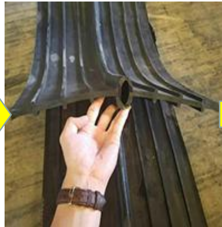
7. 根据模具可以生产各种止水带 according to change the mould it can produce many kinds of waterstop belts