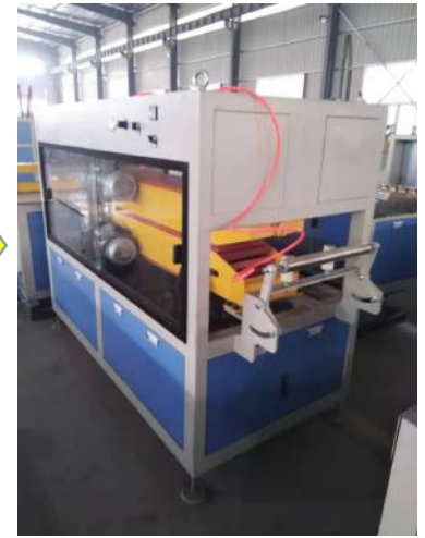
4. 牵引机 hauling off machine