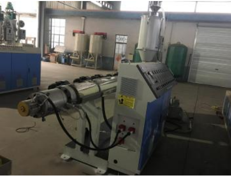
1.单螺杆挤出 singel screw extrusion