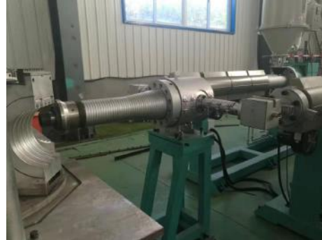
2.螺杆机头 mould head