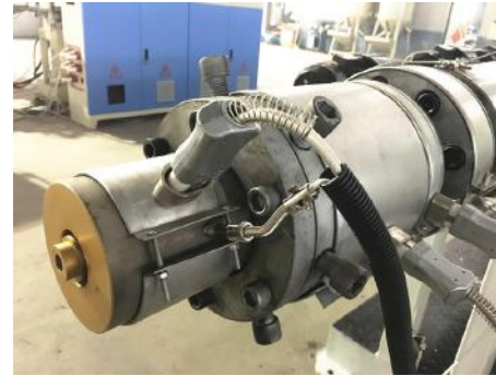
3.双螺杆挤出机头 mould head