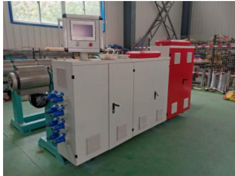
1.单螺杆挤出机SJ-80×156 1台 single screw extruder SJ-80×156 1set