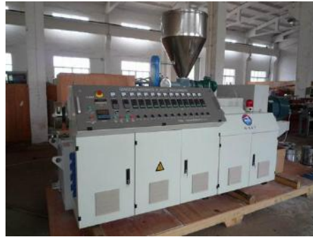
2. 双螺杆挤出 twinscrewextrusion