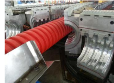
4.波纹管成型 corrugated pipe forming