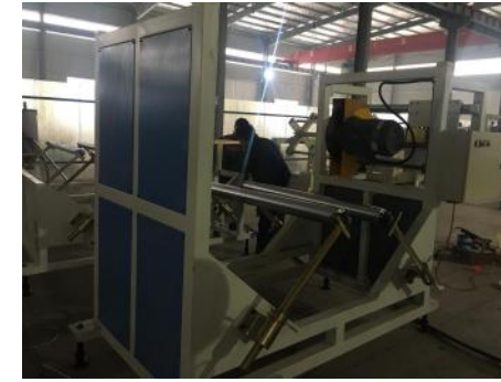
6. Melt pump