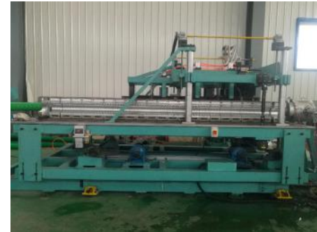
4.成型机SBCJ-315型（带有自动润滑系统） 1台 forming machine (with auto lubrication system) 1pc