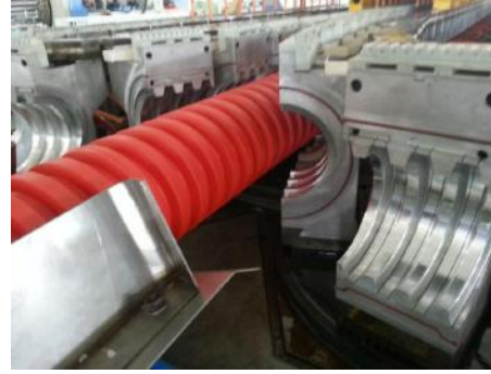
3.模具调整支架 +连接体件 1台 mould adjustable bracket & connected part