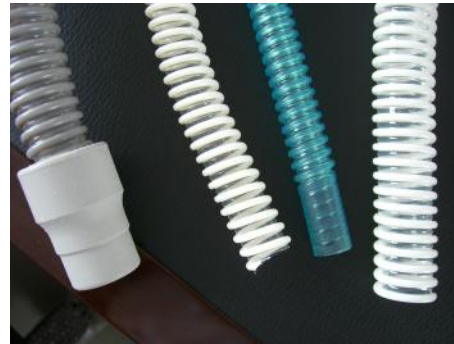
7.根据模具可以生产各种波纹管 according to change the mould it can produce many kinds of corrugated pipe