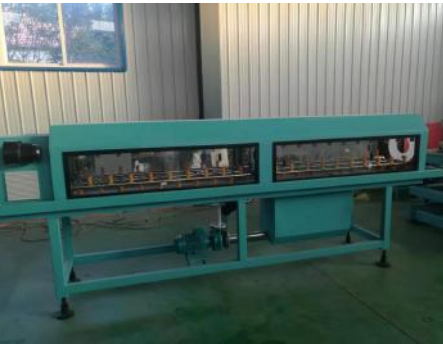
5.喷淋水槽 spray water channel